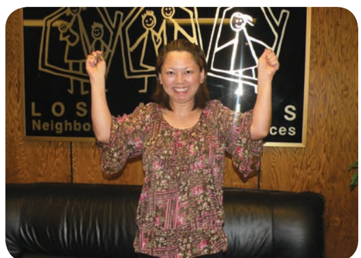
"Check them out because NHS does good work."