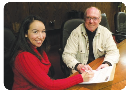
than what I asked for."