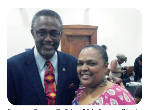
Senator Curren D. Price, 26th Senate District and Lori Gay at the California Black Legislative Caucus "Homeowners Bill of Rights" event.